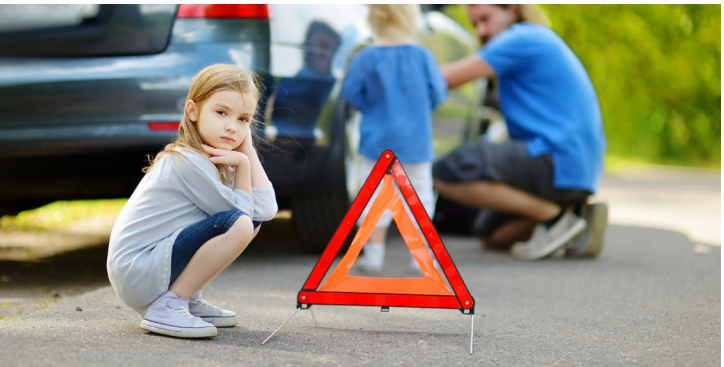
Lubrico Warranty Inc., 2124 Jetstream Road, London, Ontario N5V 3P5